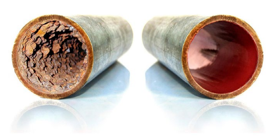
What is Flushing & Chemical Treatment?